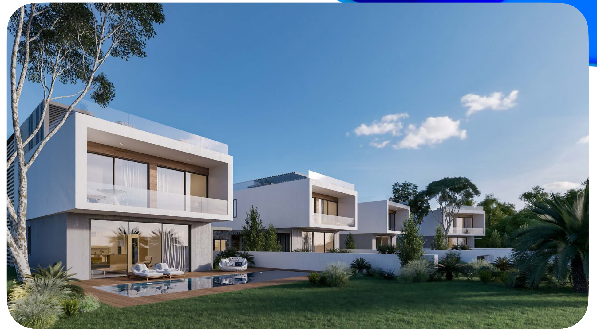
Villa Divino Mare, 3 bedrooms, Paphos, €1 650 000

See top 10 properties to get permanent residency