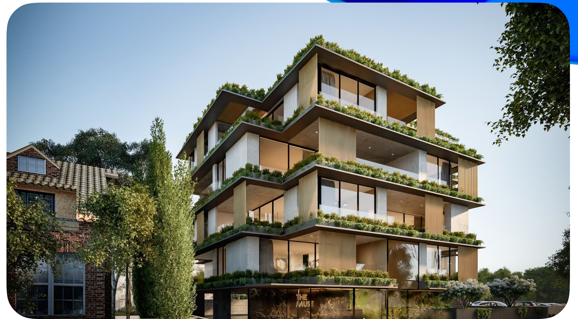
Apartments The Muse, 3 bedrooms, Limassol €760 000

See top 10 properties to get permanent residency