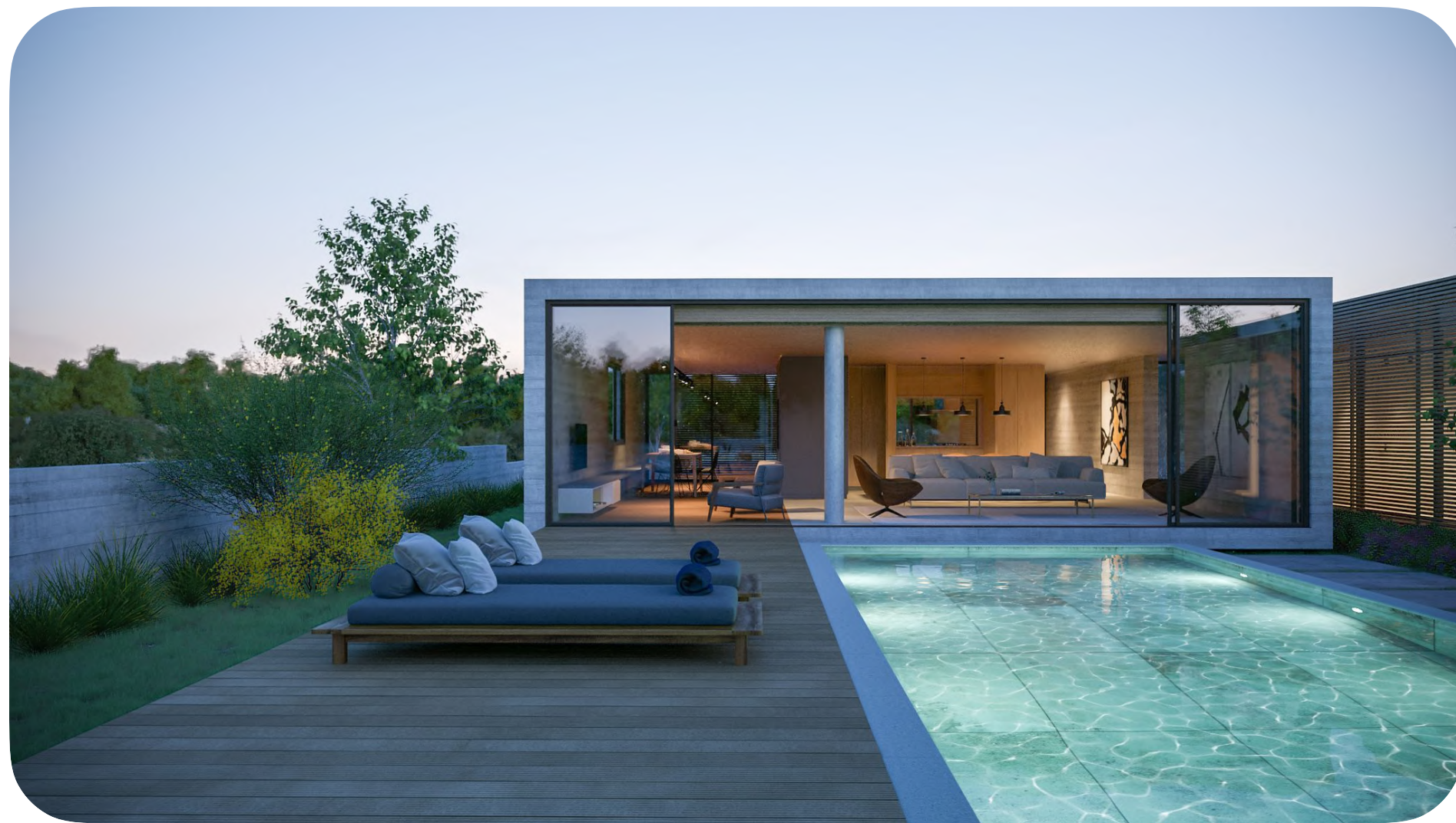
Villa Contemporaria, 4 bedrooms, Paphos, €930 000