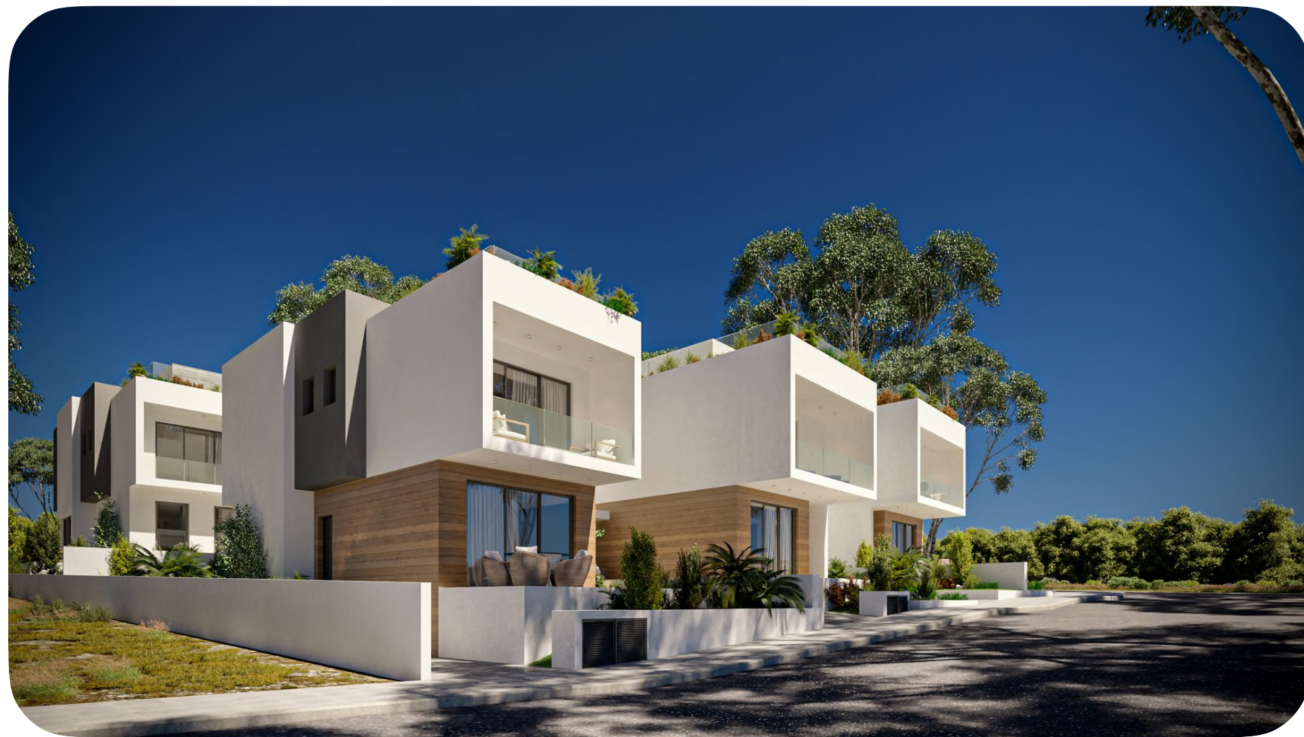
Villa Legacy, 3 bedrooms, Paphos, €400 000